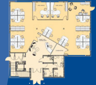
Ground Floor Unit 1