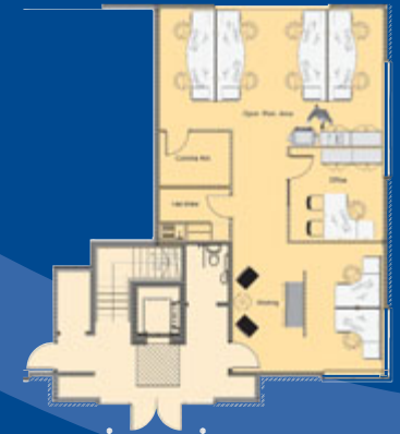
Ground Floor Unit 4